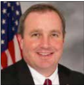
Jeff Duncan, US House of Representatives South Carolina 3rd

both the Republican primary and the general election, despite having never before been elected to office. Propelled by tens of thousands of grassroots activists across Texas, Ted's election has been described by the Washington Post as "the biggest upset of 2012 . . . a true grassroots victory against very long odds."