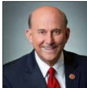
Louie Gohmert US House of Representatives Texas 1st