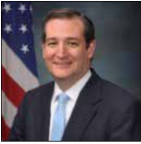
Ted Cruz, US Senate, Texas

In 2012, Ted Cruz was elected as the 34th U.S. Senator from Texas. A passionate fighter for limited government, economic growth, and the Constitution, Ted won a decisive victory in