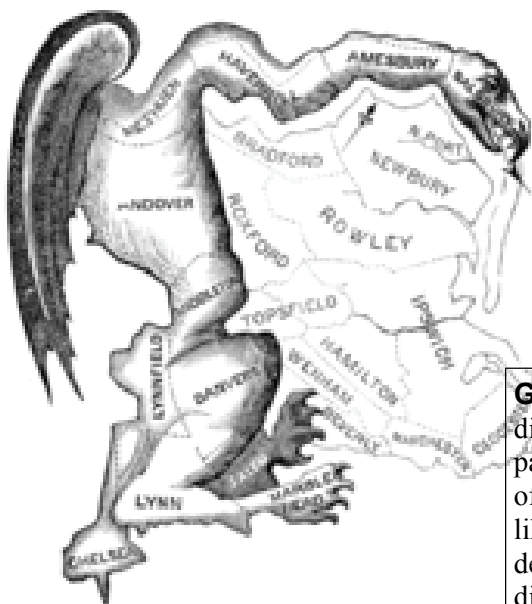
Gerrymandering. This 1812 political cartoon illustrates the electoral districts drawn by the Massachusetts legislature to favor the incumbent party candidates of Governor Elbridge Gerry. It depicts the bizarre shape of a district in Essex County, Massachusetts, as a dragon. The painter likened it to a salamander, and the editor advised "Better say Gerrymander." The name stuck. And so did the practice of politicians drawing district lines to favor themselves.

This proposition would eliminate the independent Commission and return all redistricting to the hands of the politicians.